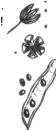
Partially eaten seeds